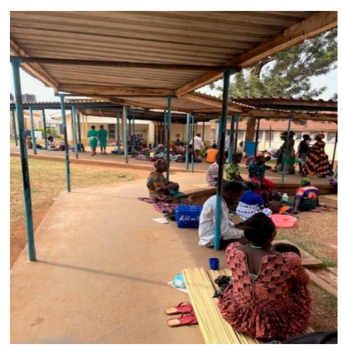
Hospital walkway – view towards maternity department