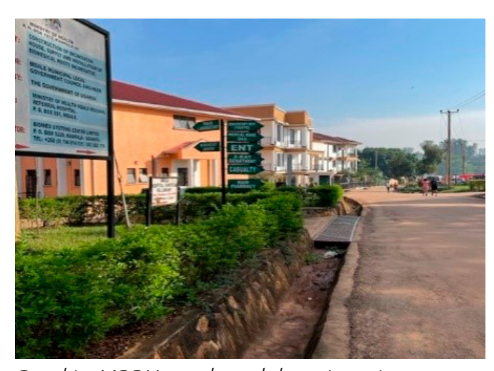
Road to MRRH wards and departments