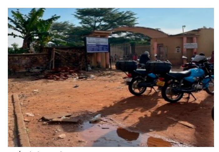
Administration entrance to MRRH

in Llanelli. She works on the delivery of a wide variety of commercial and non-commercial clinical research ranging from oncology stroke and diabetes to surgical and respiratory studies, mostly in the secondary care setting within Hywel Dda University Health Board.